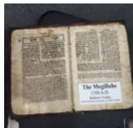
1300 AD Megillah, Hebrew and Aramaic, with commentary by Rashi.

YOUR WORD is a lamp to my feet and a light to my path.