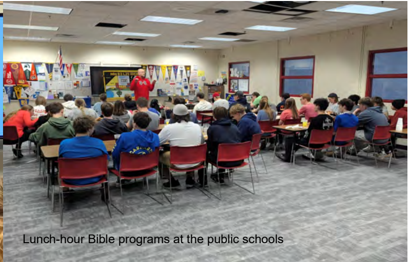
Lunch-hour Bible programs at the public schools

Our staff is located in 19 different areas across the US. Praise the Lord! Preaching and teaching is being done in all these areas.