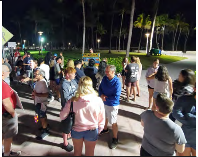
Liberty University Students Miami - Spring Break

"Year in Review" Lots of pictures! I will add an insert letter if you feel like reading. Just as a reminder, we try to email an update near the beginning of each month with up-to-date pictures, testimonies, prayer requests, etc. If you do not currently receive our monthly emails, and you would like to, please let us know . Jot me an email at: oacmichigan@gmail.com