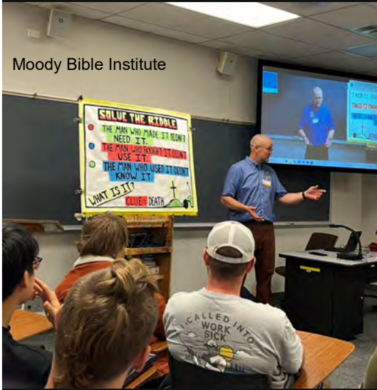
Moody Bible Institute