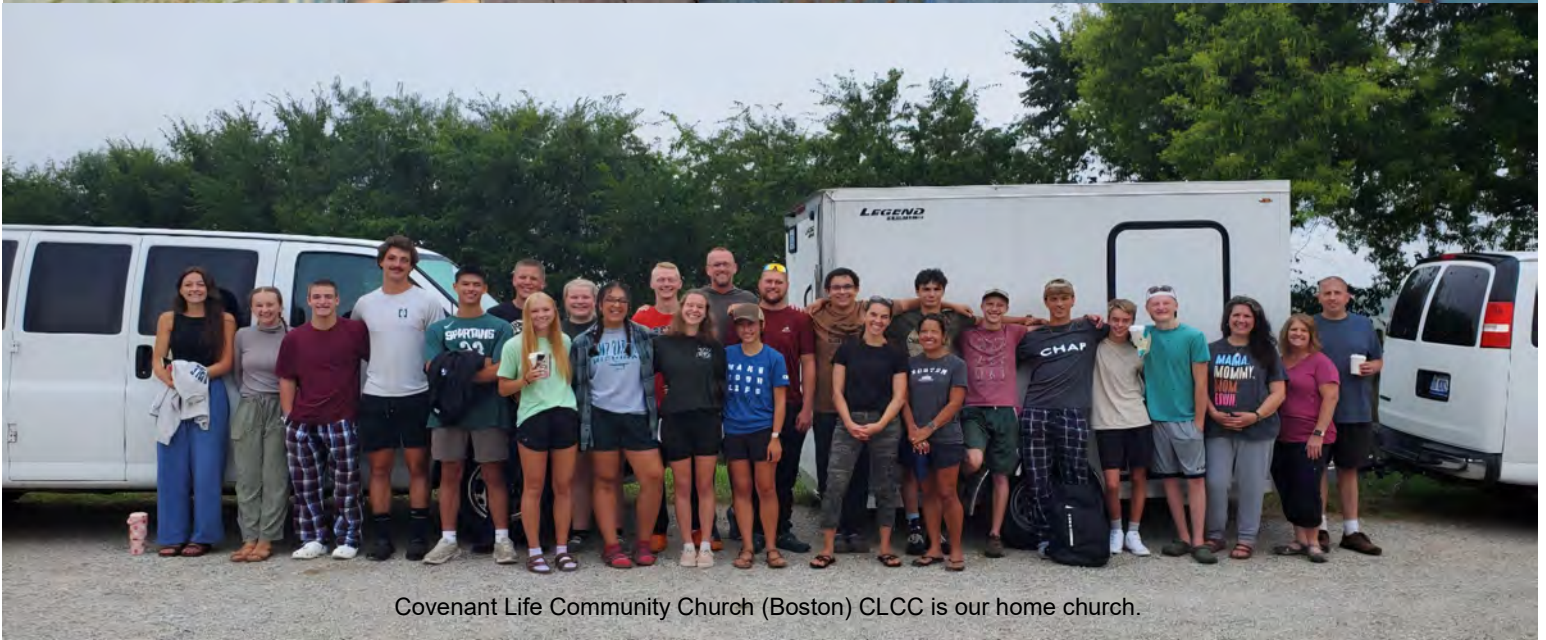
Covenant Life Community Church (Boston) CLCC is our home church.