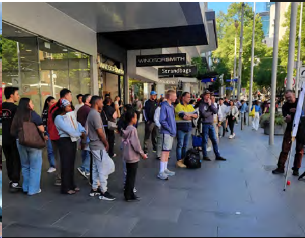
Melbourne w/OAC Australia