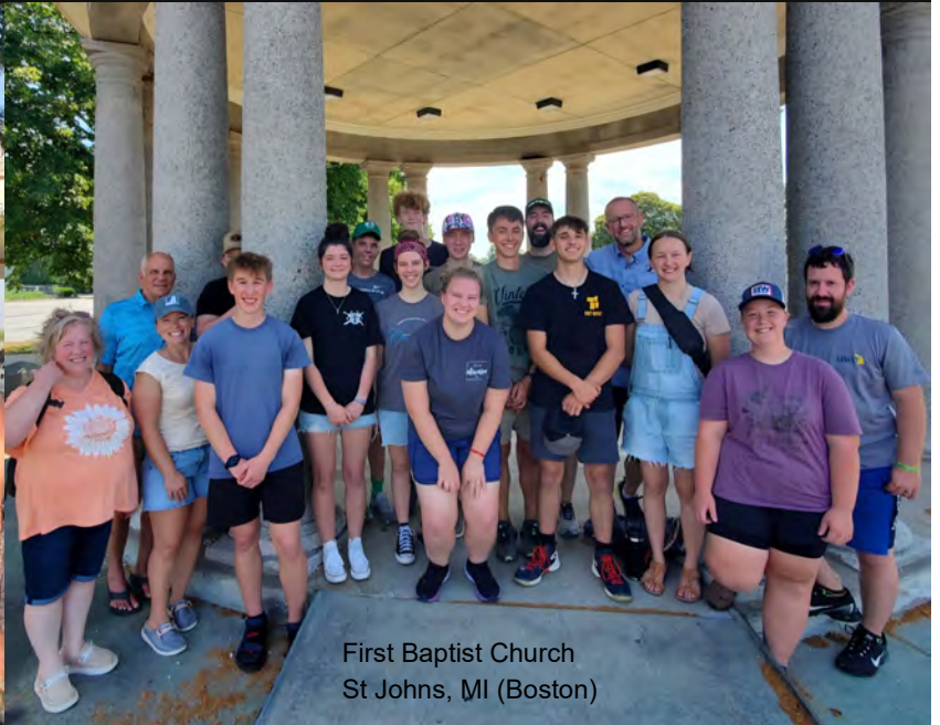
First Baptist Church St Johns, MI (Boston)