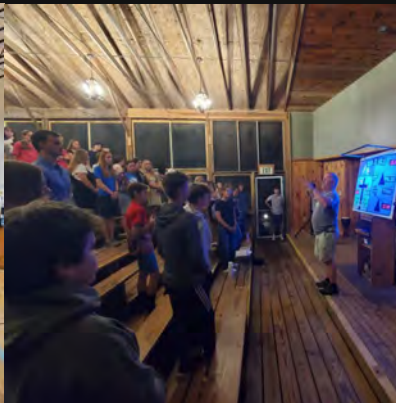
Pleasant Valley Bible Camp