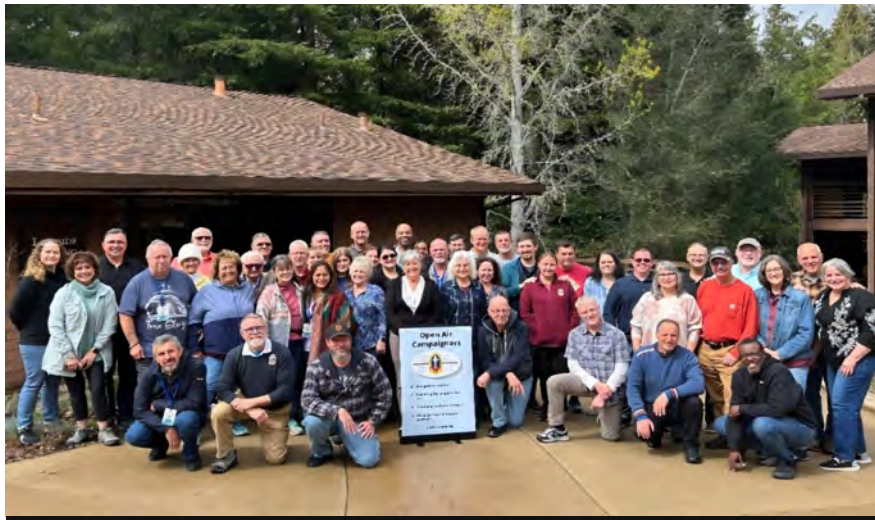
OACUSA Staff Conference - San Jose