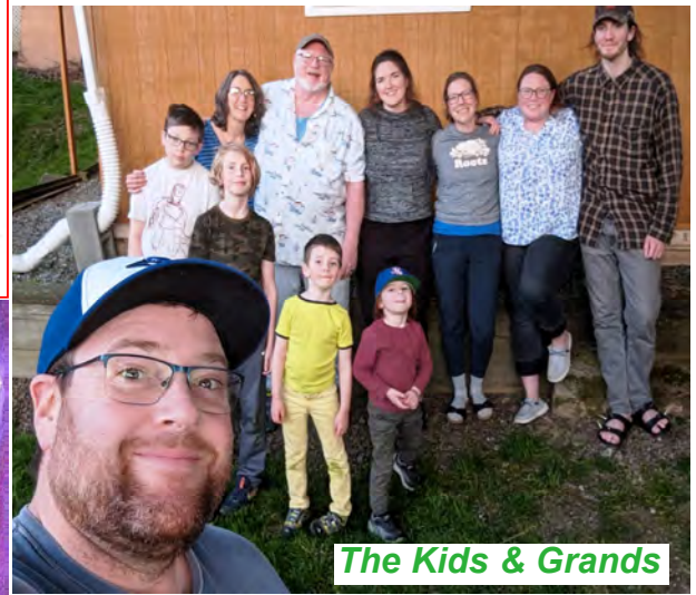
The Kids & Grands