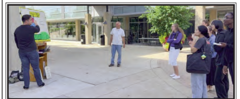
GBSC student preaching the gospel at Northern Kentucky University.