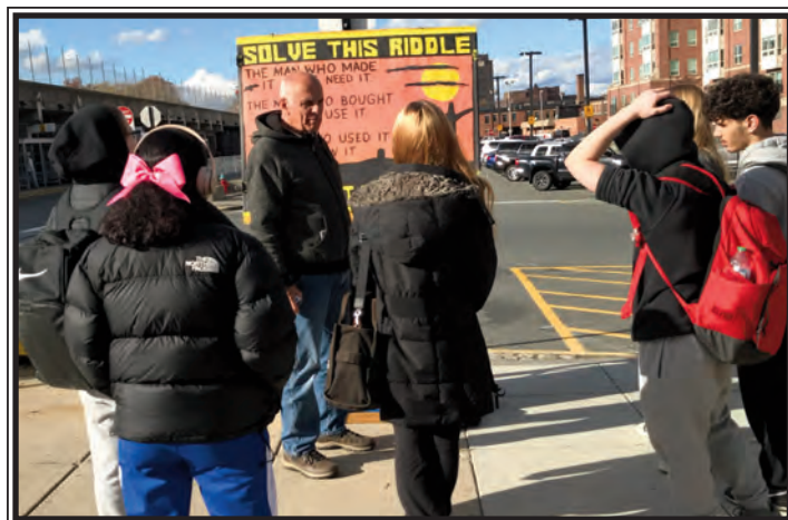
Six high school students outside the Quincy Transit Station, asking many questions. Two wanted Bibles before they left.