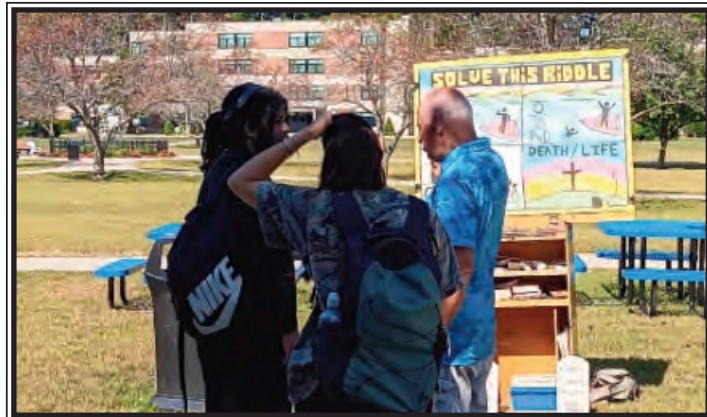
Both these students at Westfield State University were surprised that it was possible to be sure of heaven when they read I John 5:13.