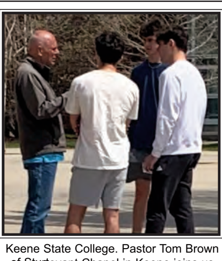
of Sturtevant Chapel in Keene joins us here. Pray for his health.