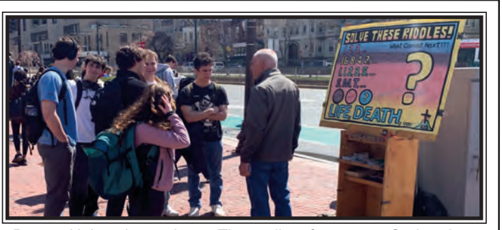
Boston University students. The reality of a creator God and an afterlife always seems to stop students.