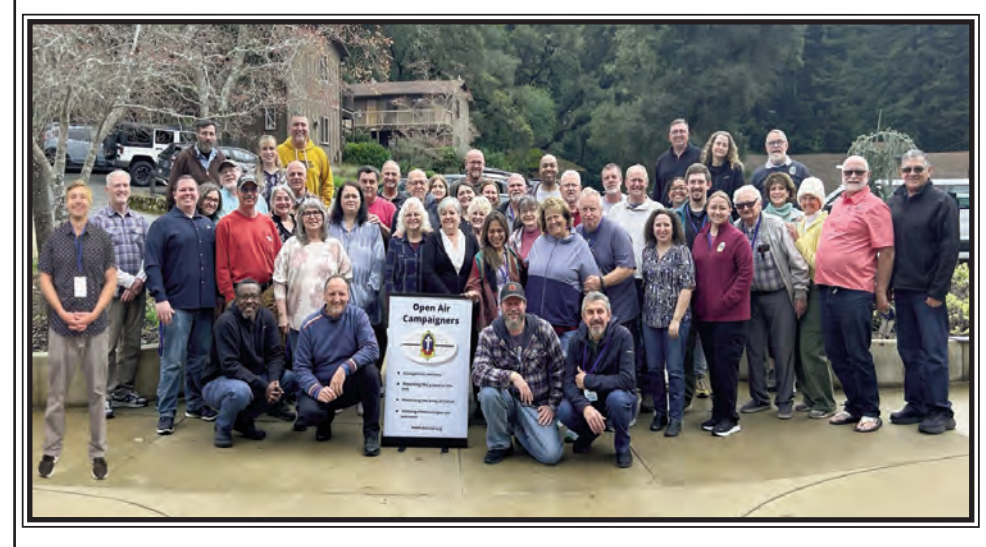
OAC-USA staff Conference Mt. Hermon Conference Center, Santa Cruz CA.

Gifts are tax deductible when made out to OAC and sent to: PO Box D • Nazareth • PA • 18064