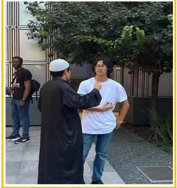
A Muslim Imam trying to make a convert at ATT Discovery Center in Dallas.