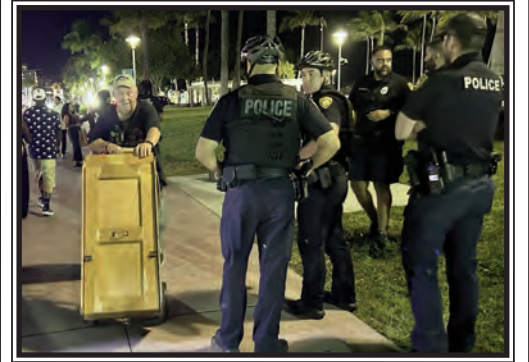
Police shutting us down with a new ordinance saying the sketchboard must be portable.