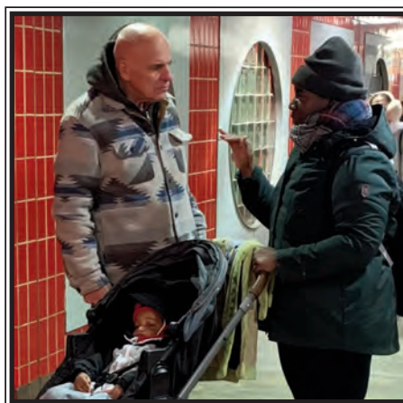
Subway ministry. This lady had just been told to "give her life to Christ." I told her she needed to trust that Christ gave His life so she could be forgiven.