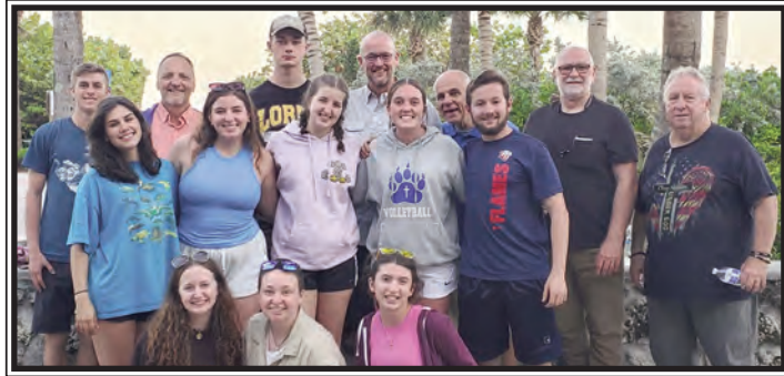
The entire Liberty team at South Beach.