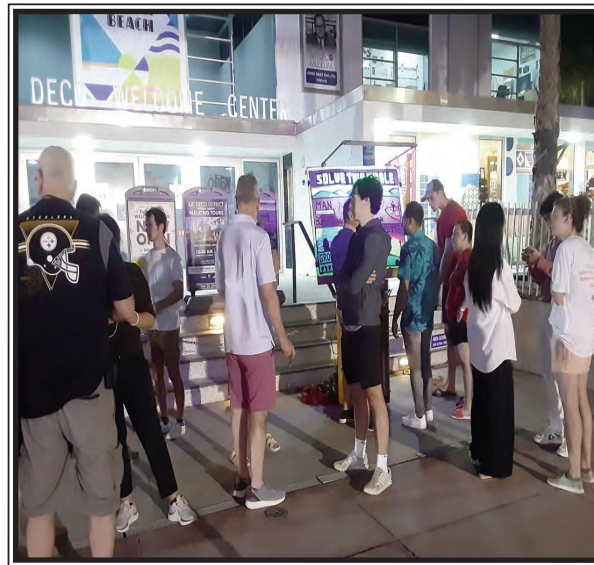
Open-air meeting on Ocean Blvd. using the sketchboard attached to the two wheel hand truck.