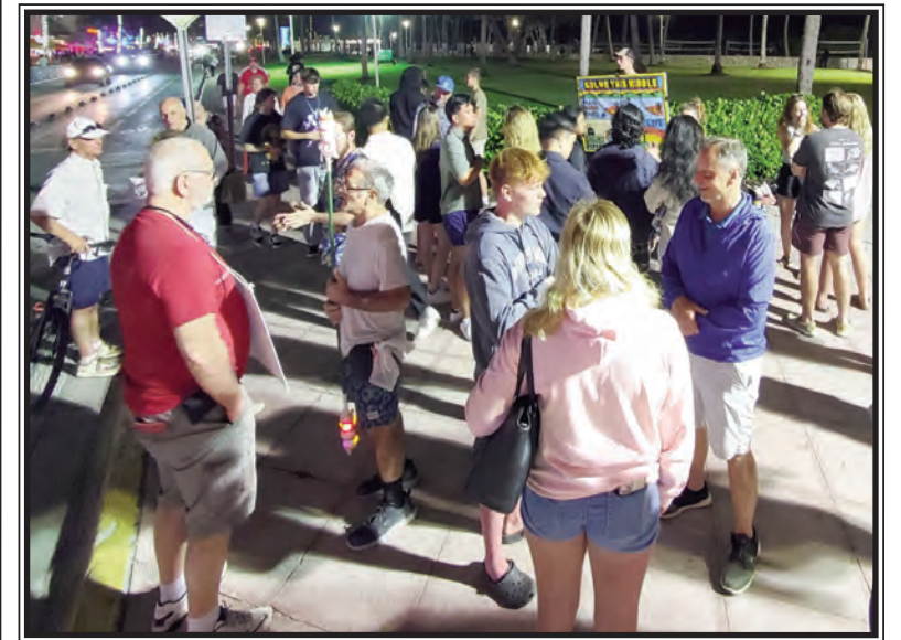
Our new design the next day, the message clipped to fiberglass insulation held by a student. The police smiled and let us continue.