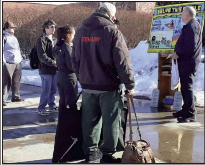
Westfield State University where we partner with Cru and have had tremendous conversations, as well as angry opposition.