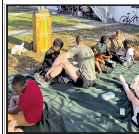
Liberty University students doing lessons with the children after it was taught on the sketchboard. The parents loved seeing us in their neighborhood