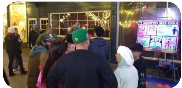
More ministry at Mission Inn