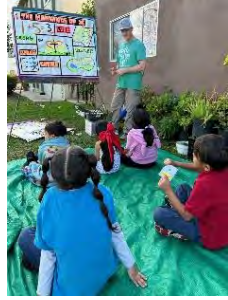
Me getting to teach the kids again