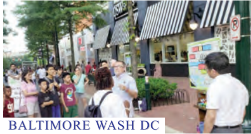
BALTIMORE WASH DC