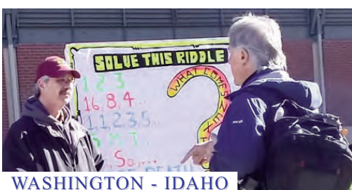
WASHINGTON - IDAHO