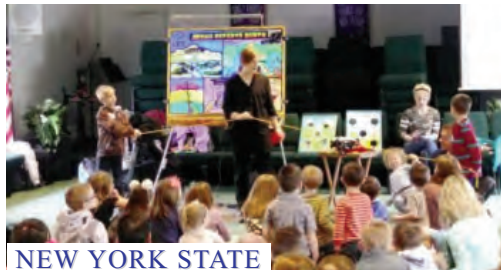
NEW YORK STATE