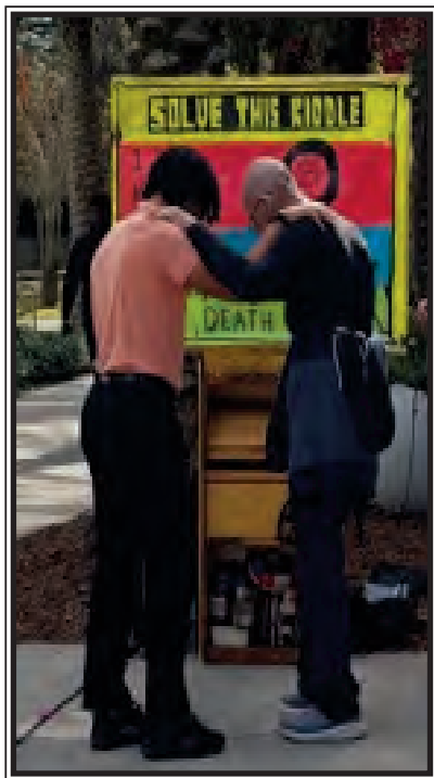
University of South Florida