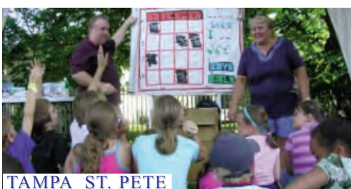
TAMPA ST. PETE