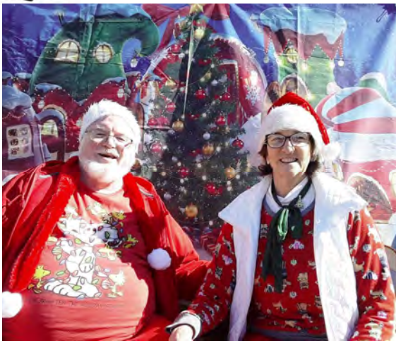
OLD ST. MICK & SIDEKICK (THE MRS) - OLD ST. NIC'S SIBLINGS (IN CHRIST)

★ For God so loved the world He gave His one and only Son that whoever believes in Him shall not perish but have eternal life John 3:16