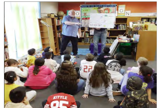
Teaching lots of public school kids the most important lessons of their lives - Bible lessons