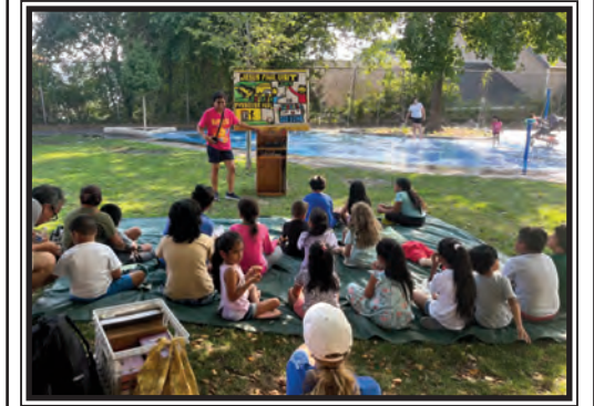
Kids club with Iglesia Bautista El Calvario in Chelsea with mission teams from PA and NH.