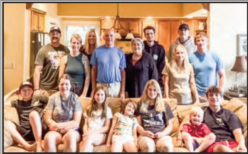
Family Consecration week in New Hampshire