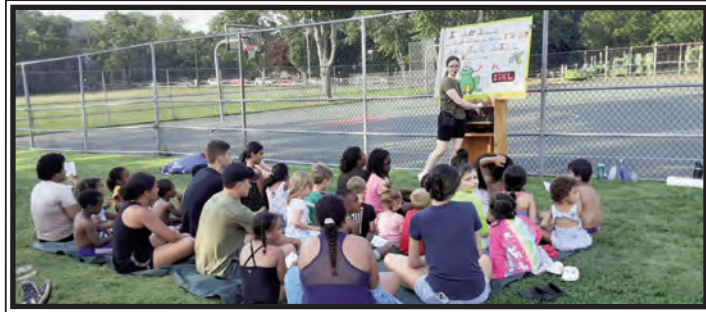
Children's program at Hopewell playground with Winthrop St. Baptist Church in Taunton. OAC team from Michigan assisting.