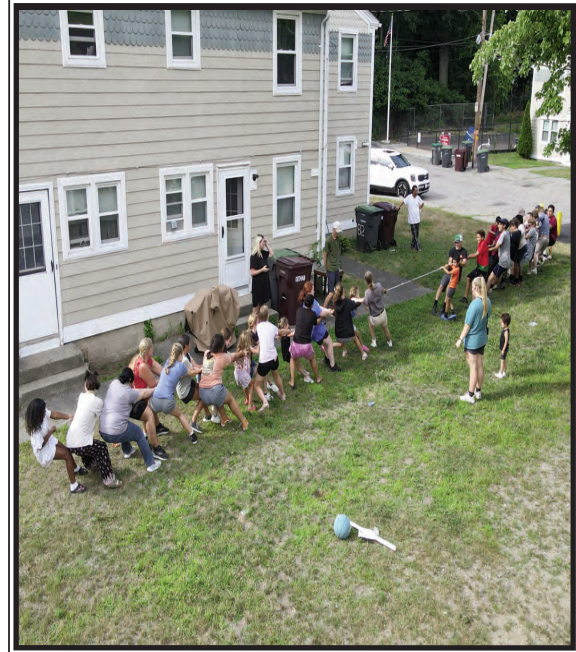
Game time with kids in Dedham and Calvary Baptist Church with a mission team from Michigan.