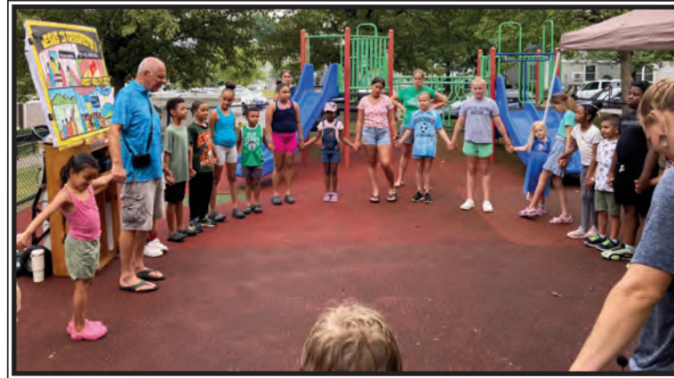
Kids club with Calvary Chapel In The City with a mission team from NY at Mission Hill in Boston.