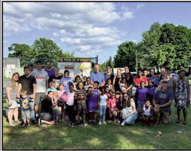
Paul Bunker Homes in Taunton where we had a second club with Winthrop St. Baptist. The children in these neighborhoods love learning about Jesus.