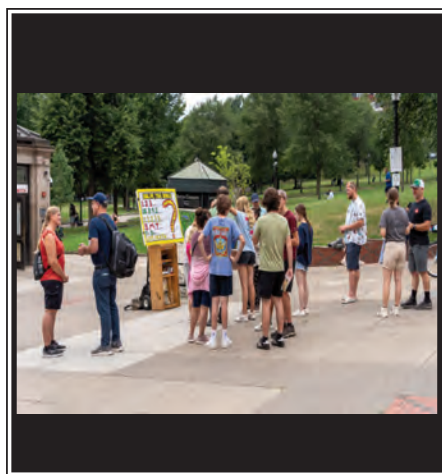
Many gospel conversations in the Boston Commons with the Michigan teens and leaders.