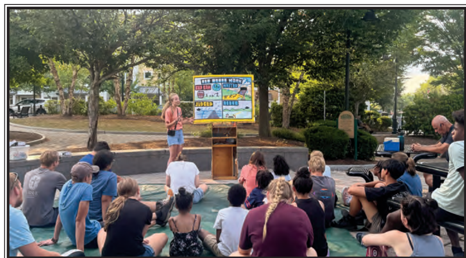
Children's program with Charles River Church and Michigan team in Roslindale.