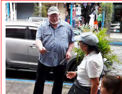
Jesus described the sower going out and broadcasting the seed widely on the field...and some fell on good soil and produced an abundant harvest. Gospel tracts are used of God like that (seeds of salvation) – so we have spread thousands of them around so far in 2024!