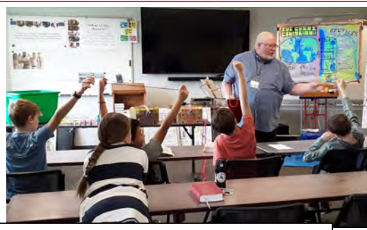
And we dare not neglect to reach the kids in our own church, when satanic forces are all out targeting them for later disillusionment and abandonment of Christianity & Church (which is happening in droves these days in all Western nations like ours that used to be culturally Christian oriented).