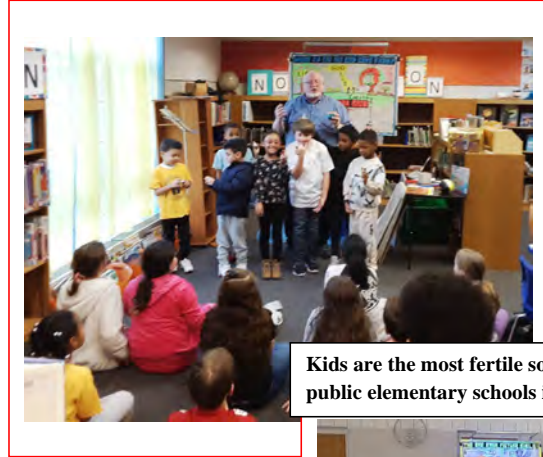
Kids are the most fertile soil of all – Good News Clubs in public elementary schools is a great way to reach many