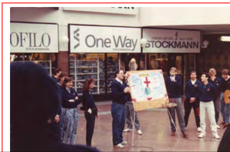
An old throw back pic from the 1980s when I started doing OAC style sketchboard Gospel proclamation after that fateful OAC training course.