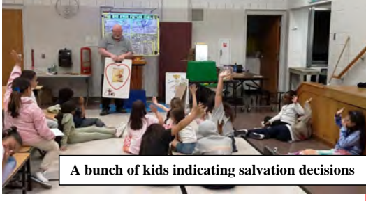
A bunch of kids indicating salvation decisions