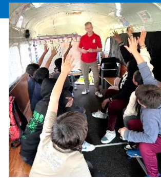
Teaching kids with Released Time Education on a school bus converted into a classroom !

Hello – on my way to help some saints share the glorious Gospel with Muslims, I saw a flock of about ten, white doves fly by. I was reminded of two Scriptures; when the Holy Spirit descended in the form of a dove, as the Lord Jesus was baptized (Matthew 3) and when Elisha asked for a double portion of the spirit of Elijah (2 nd Kings 2). Seeing the birds, I prayed to the Lord, admitting that I needed a ten-fold filling of the Spirit in order to serve Him well. I am grateful that He is a gracious Father, Who gives the Holy Spirit to His kids who ask Him (Luke 11). May these recent stories be a blessing: