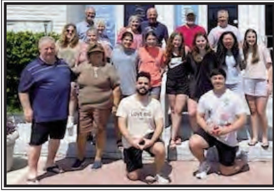
OAC/Liberty team picture at Calvary Chapel Miami Beach where we stayed.