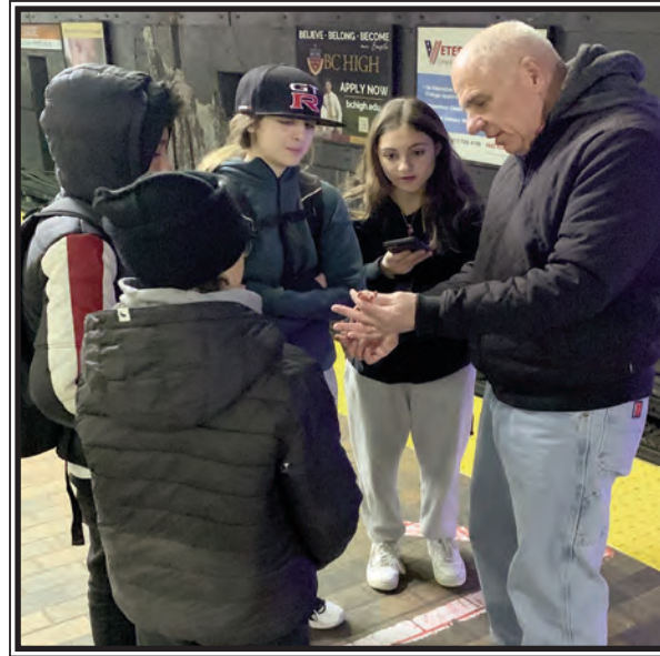
Using object lessons in the subway is a great way to get attention and communicate the Gospel.