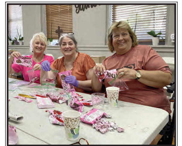
Without these three ladies in Miami, we would have been up a creek.