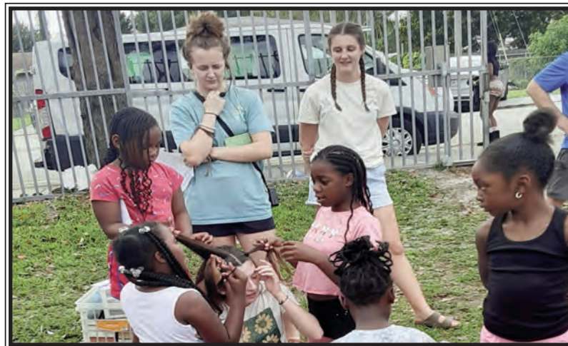
Children from Buena Vista giving a Liberty student a hair make-over.