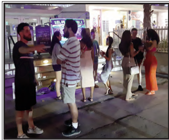
Liberty students were in constant conversations like this every night.