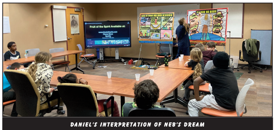
DANIEL'S INTERPRETATION OF NEB'S DREAM