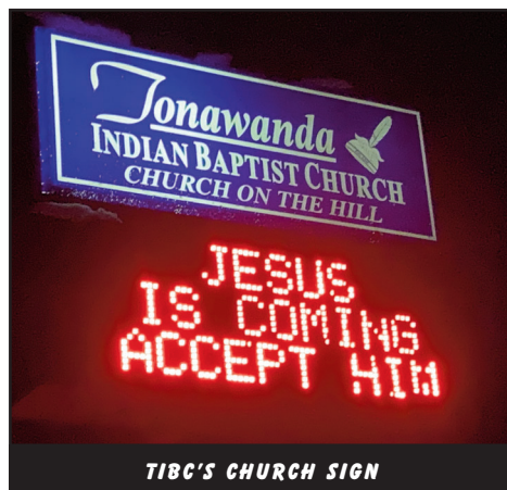
TIBC'S CHURCH SIGN