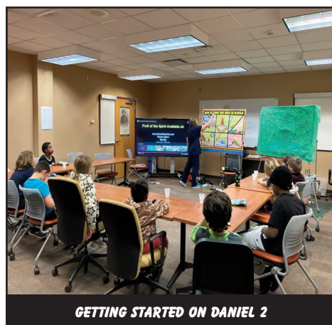
GETTING STARTED ON DANIEL 2