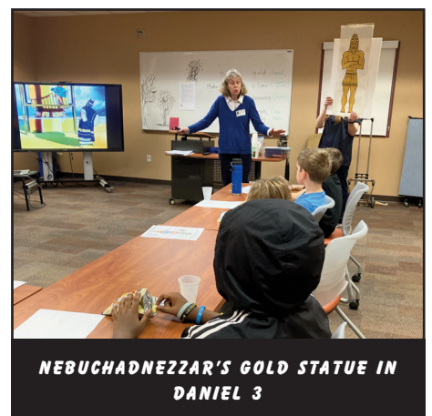
NEBUCHADNEZZAR'S GOLD STATUE IN DANIEL 3