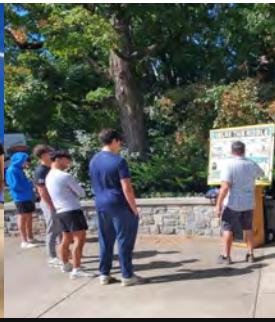
Central PA Branch (Penn State)