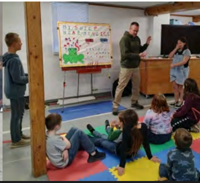
OAC Branch Inland NW, Idaho