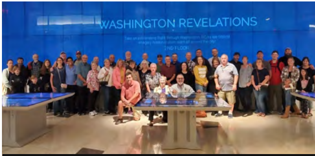
OAC/USA Staff Conference (Bible Museum, DC)