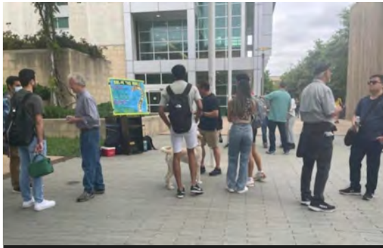
OAC Branch Dallas, Texas