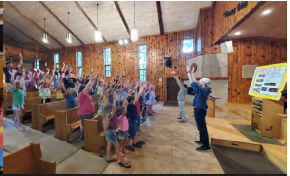
Camp Barakel Family Camp - Michigan