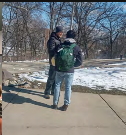
Michigan Colleges... MSU, CMU, WMU

On the web at: oacusa.org - facebook.com/oacmichigan