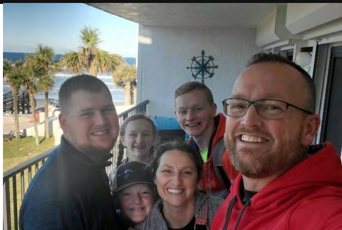
Family Vacation in Florida (January)

Please let us know. If you do not receive our monthly newsletters by email, and you would like to, please let me know by emailing me at: oacmichigan@gmail.com