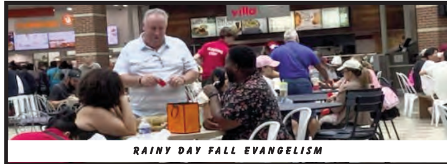
RAINY DAY FALL EVANGELISM

Praise God for the many opportunities He gave us to share the Gospel this past year. Please continue to pray for those who have heard the Word and would come a saving knowledge of Christ.