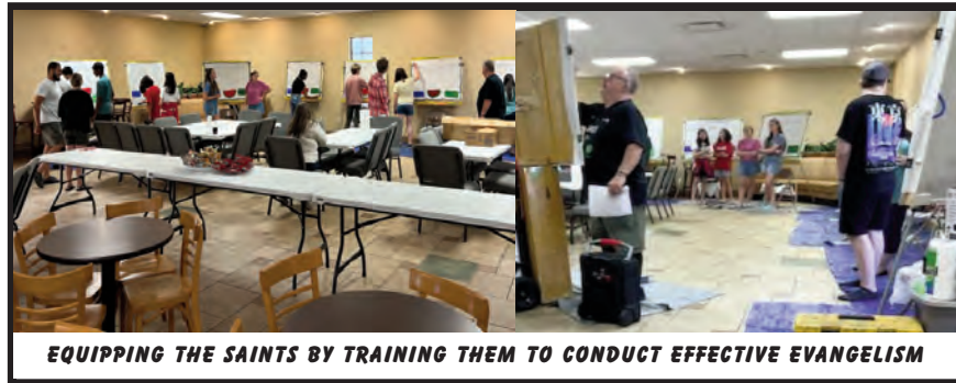
EQUIPPING THE SAINTS BY TRAINING THEM TO CONDUCT EFFECTIVE EVANGELISM