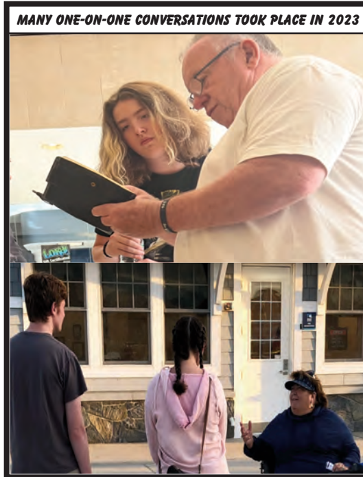
MANY ONE-ON-ONE CONVERSATIONS TOOK PLACE IN 2023