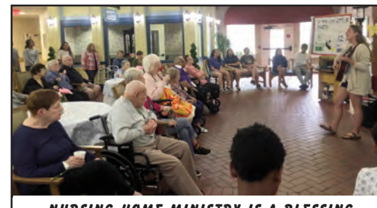
NURSING HOME MINISTRY IS A BLESSING