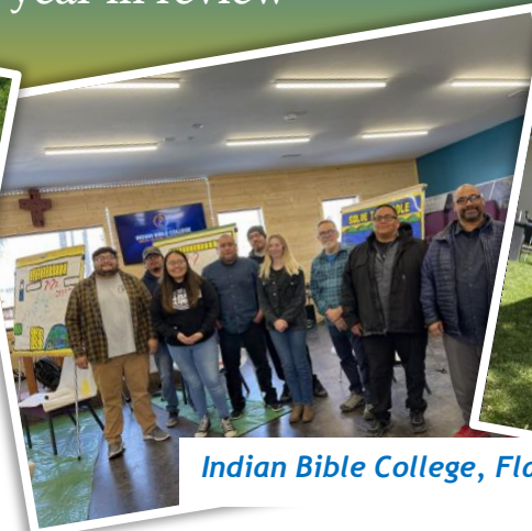
Indian Bible College, Flagstaff, AZ