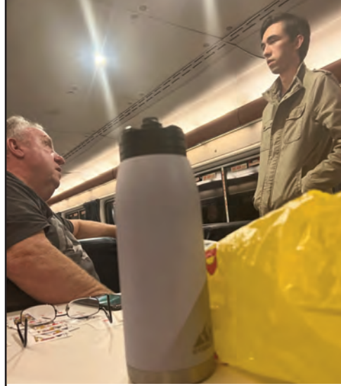
This was on the Amtrak going from Florida to New Hampshire. This young man was a Jehovah witness.