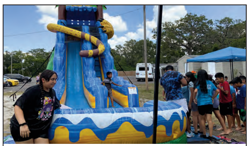
It was a blessing to train and equip a youth group that came in from Orlando. We went into the migrant neighborhoods and shared the Gospel. We then conducted a closing program on the last day just loving on these kids and playing games. But, more importantly, we spent one-on-one time seeing exactly where they were when it comes to knowing Jesus. Praise God for our home church in Brandon, Florida, (CC Brandon) who went out and shared the Gospel as a team.