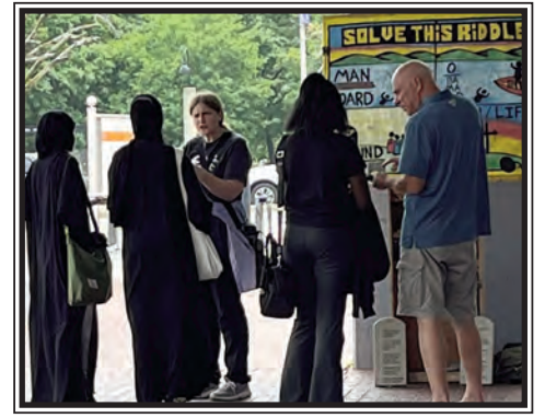
Roxbury Crossing is a subway station across from the biggest Mosque in Boston It is also the station used by three high schools and a community college. Pray for the salvation of souls at this place.