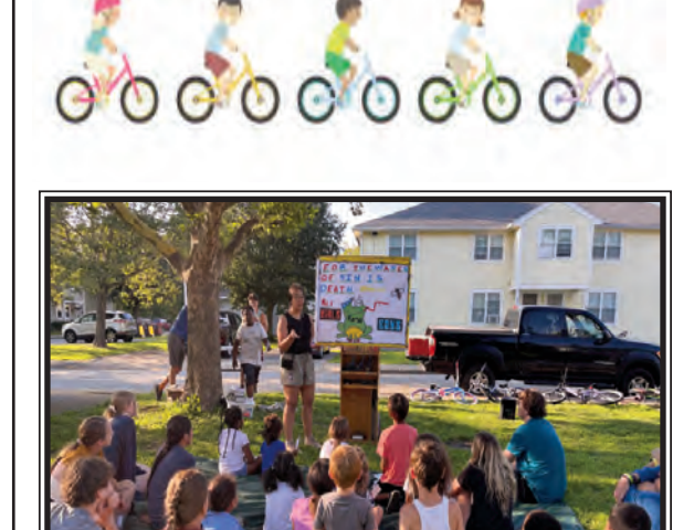
Kids Club at Lake St. Homes in Weymouth with a mission team from Michigan. Bicycle parking was free!