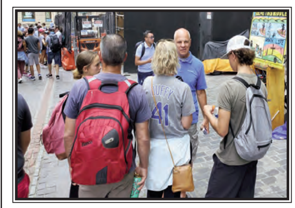
Old State House Boston. This family of four is from LA and both teen children and their mother were very curious, asking questions on how you could know personally the Lord's forgiveness. The father was also intently listening.