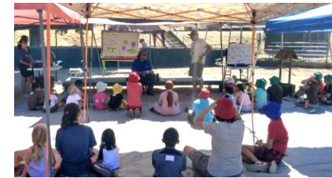
VBS in Julian

Hello! For us on the west coast, it seemed that we went without a spring this year. Summer showed as if a light switch was turned on, directly from winter. There are a couple of good things that usually happen with So-Cal summers--we get larger crowds in our outreach audiences & kids Vacation Bible Schools (VBS') happen at churches. By His grace, I've been invited to more VBS' this summer than ever before. I also travelled twice to Mexico to minister the Gospel during this reporting period. Enjoy these stories & stay cool: