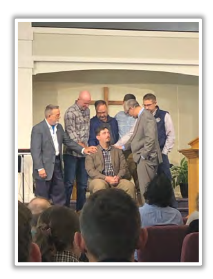
Commissioning at Belcroft Bible Church