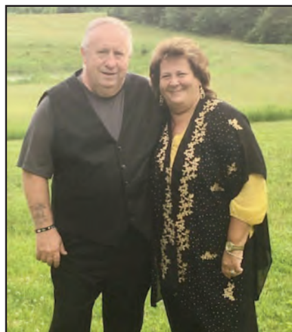
50 YEARS of marriage