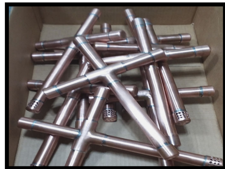
Chemical crosses going to Africa, South America etc.