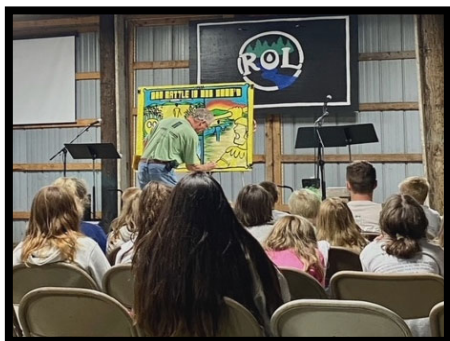
RIVER OF LIFE CAMP