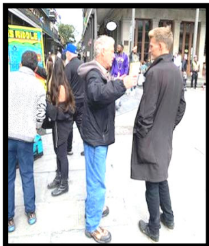
Daytime ministry at Mardi Gras.