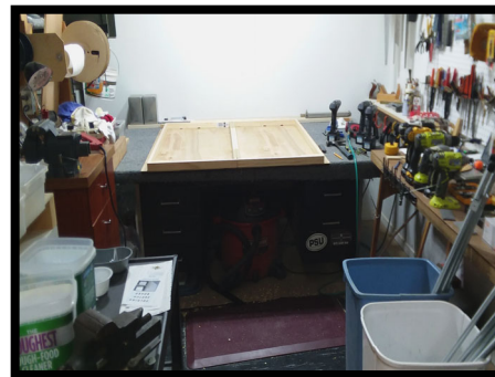
Building Folding Boards