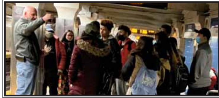
Subway meeting with high school kids.