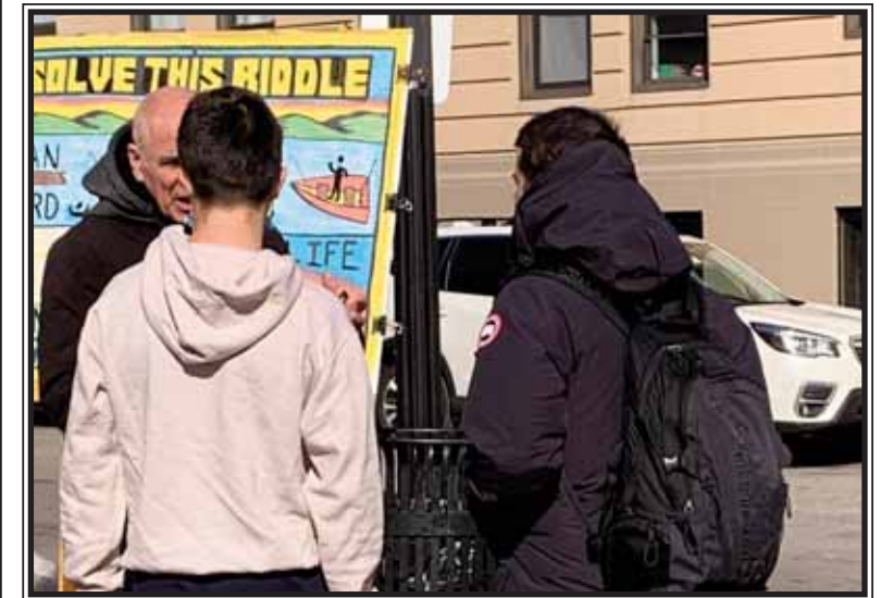
A Jewish and Protestant student at Northeastern. The Jewish student wanted to know how Jesus was related to King David so we took His genealogy back through Abraham.