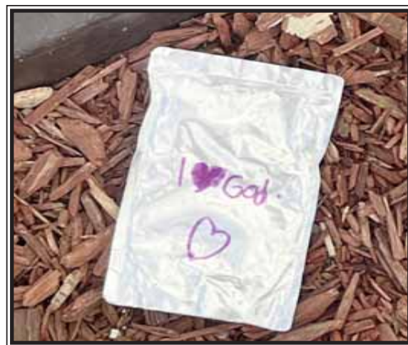
This empty juice box was left on the ground by one of the children.