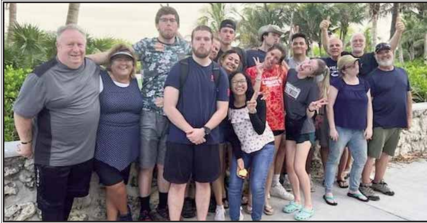
OAC staff and Liberty University students.