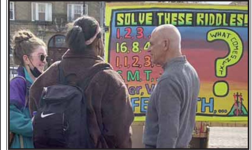
A Jewish and church going student at Boston University. They were both interested in how Jesus fit into the Old Testament.