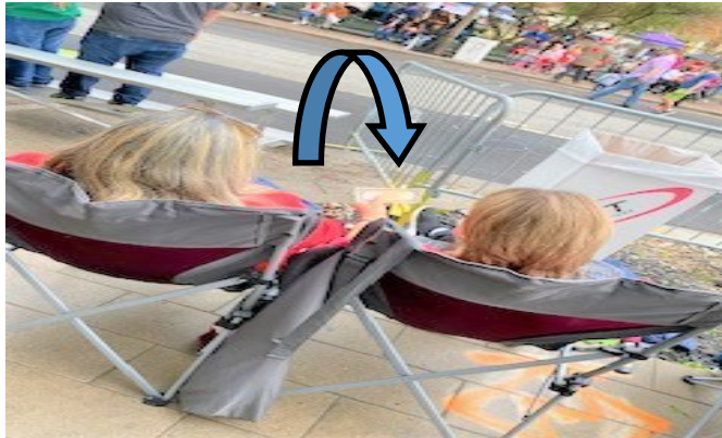
Two ladies reading a tract we just handed them at the Dallas Christmas Parade.