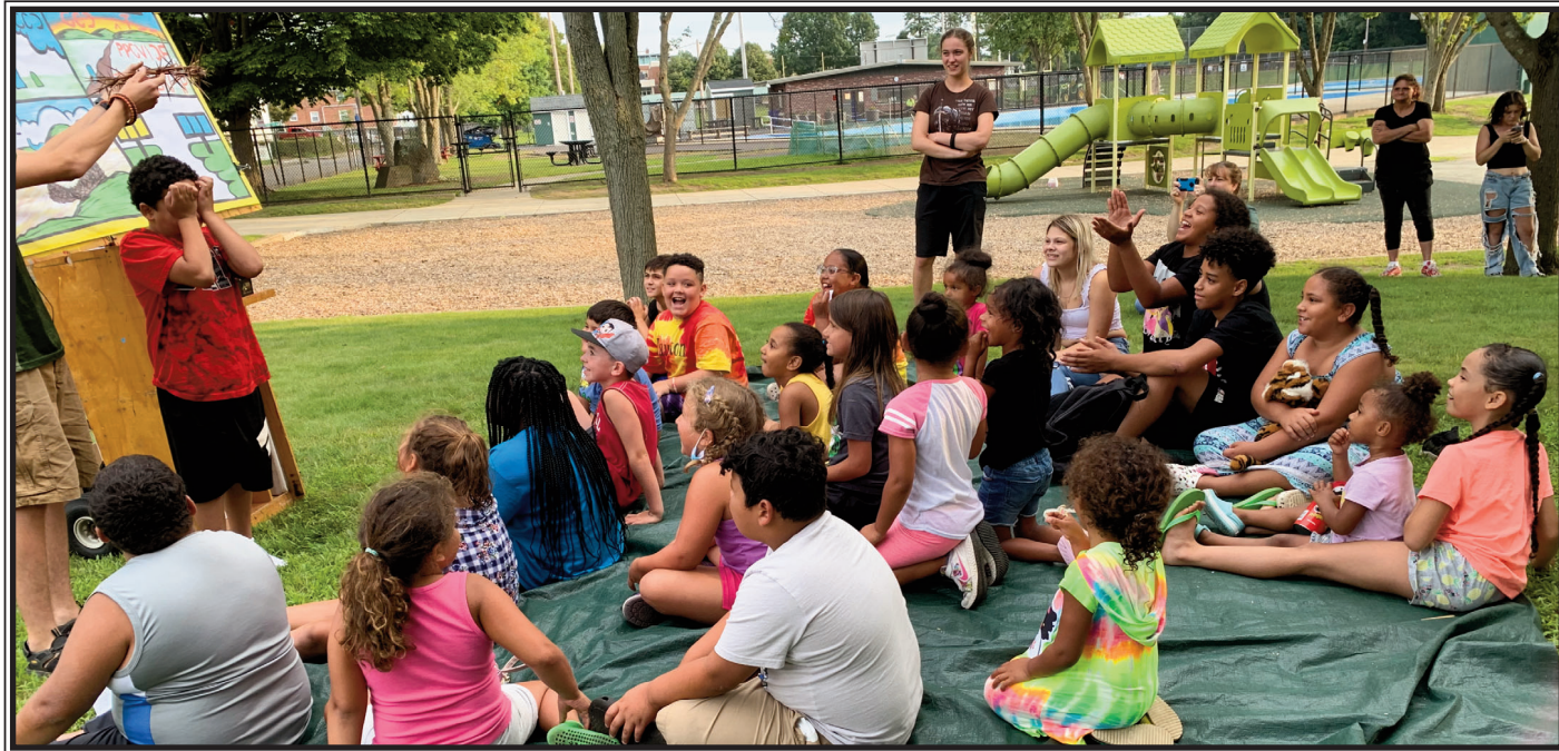
Crown of thorns object lesson at Hopewell Playground with Winthrop St. Baptist of Taunton. Look at the faces of the children on the mat!