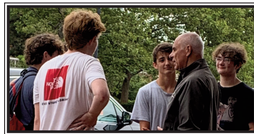
These five teens with skateboards came out of the Roxbury Crossing subway station and took an I.Q. test. After failing, they let me share the Gospel with them for five minutes. Finally one of the teens said, "What is one suggestion you would like to leave with us before we go?"