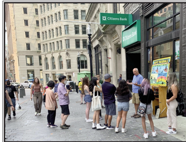
Adult meeting at the Old State House. Just around the corner is the site of the Boston Massacre.