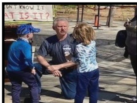
So exciting to see little ones hearing about Jesus!!!!