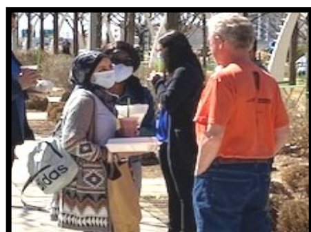
Jesus to Muslims!!!!