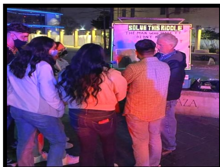
Love how the riddles on the board draw crowds!