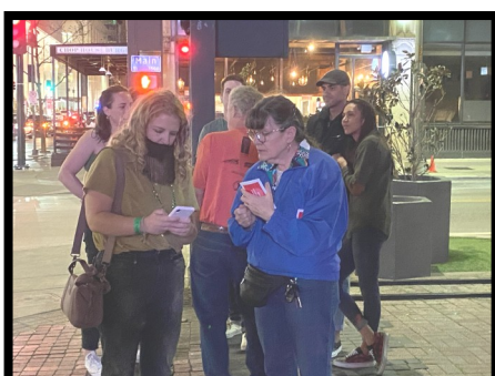
Sharing the Gospel at Pegasus Park downtown Dallas. Thankful!