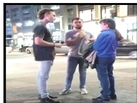
I hadn't been on the street for a while because so few people were out due to Covid. SO glad to be back!