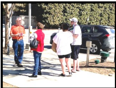
Klyde Warren Park Social Distancing but still sharing Jesus!

Now to Him who is able to do exceedingly abundantly above all that we ask or think, according to the power that works in us, 21 to Him be glory in the church by Christ Jesus to all generations, forever and ever. Amen. Ephesians 3:20