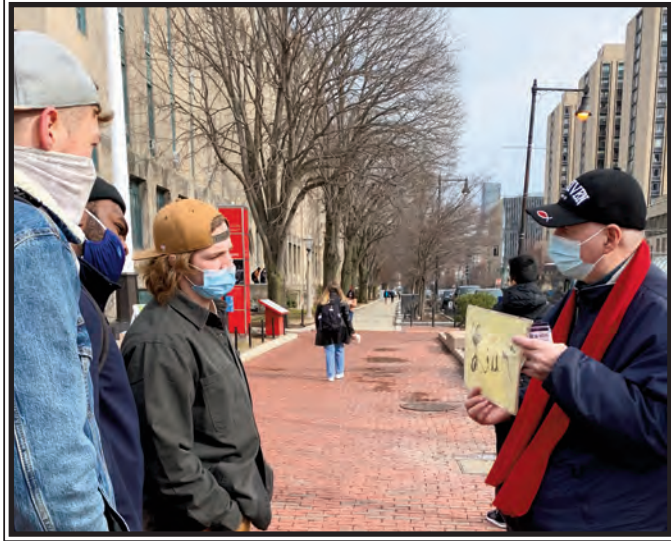
WAYNE SHARING THE GOSPEL WITH BOSTON UNIVERSITY STUDENTS.