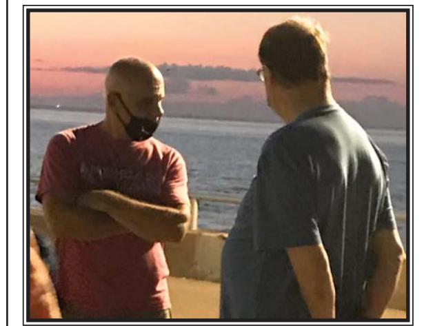
NANTASKET BEACH. THIS IS THE SPOT AND THE NIGHT OF JOHN'S DIVINE APPOINTMENT.