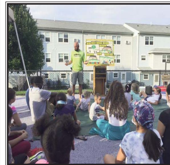
FIVE-DAY CLUB WITH CALVARY CHAPEL IN THE CITY AT MISSION HILL.