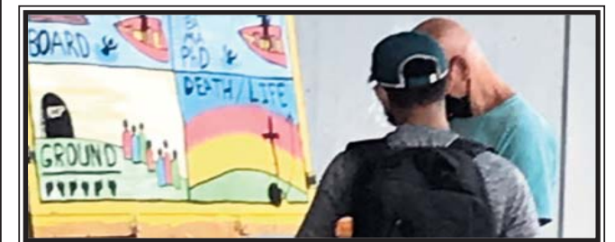
PUNITH FROM INDIA AT ROXBURY CROSSING.