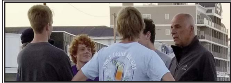
TEENAGERS AT HAMPTON BEACH NH. THEIR WISECRACKS TURNED INTO SOME SERIOUS QUESTIONS.