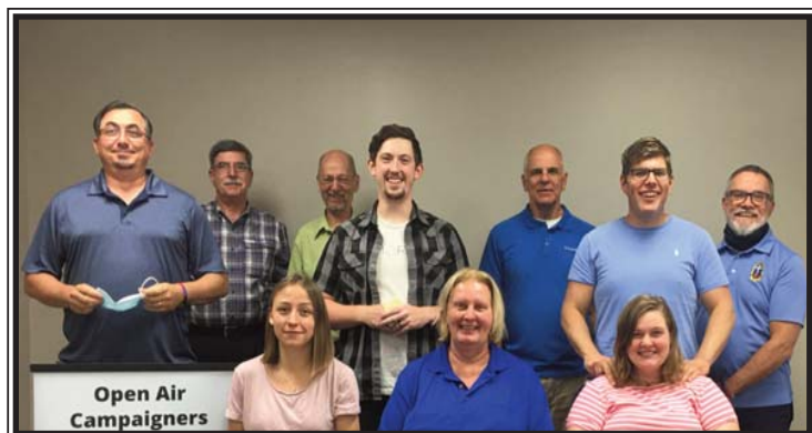
FOUR NEW FAMILIES COMING ON STAFF WITH OAC PLUS THREE STAFF WHO TAUGHT AT CANDIDATE SCHOOL. ONE HUSBAND AND WIFE COULD NOT MAKE IT BUT TWO OF THE WIVES ARE WITH CHILD.