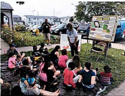
Neighborhood VBS in East Moline, Illinois

First off, we want to give glory to God for His goodness. Many doors have been opened to preach the Gospel and we have even been allowed to go into the public elementary schools here in Iowa. Partnering with 180 ministry, we do Gospel messages before and after school and also do apologetic training for the kids going to middle school next year.