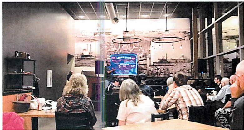
A surprise Gospel message at an Open Mic at a coffee shop in Moline, Illinois