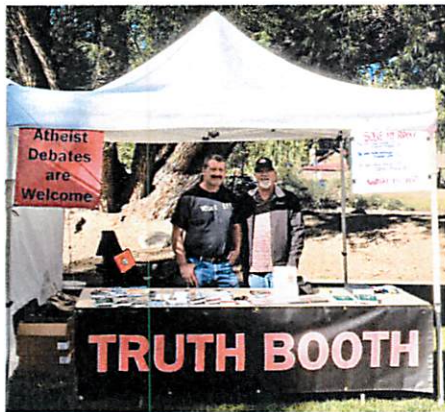
Partnering with Jake and Buena Vista Baptist Church in Colorado for a weekend festival in Buena Vista, CO.

We also partnered with 4 churches in Colorado this year in various outreaches, including booths in Buena Vista, outdoor mall outreaches in Fort Collins and a weekend park outreach in Colorado Springs.