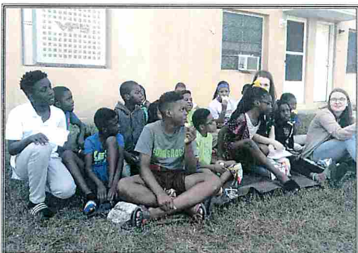
Some kids from the neighborhood on the mat with a couple of Liberty University students.