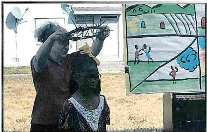
One of the kid's thought she wanted to wear the "Crown of a King" until she realized that it was the "crown of thorns" that the Romans put on King Jesus!