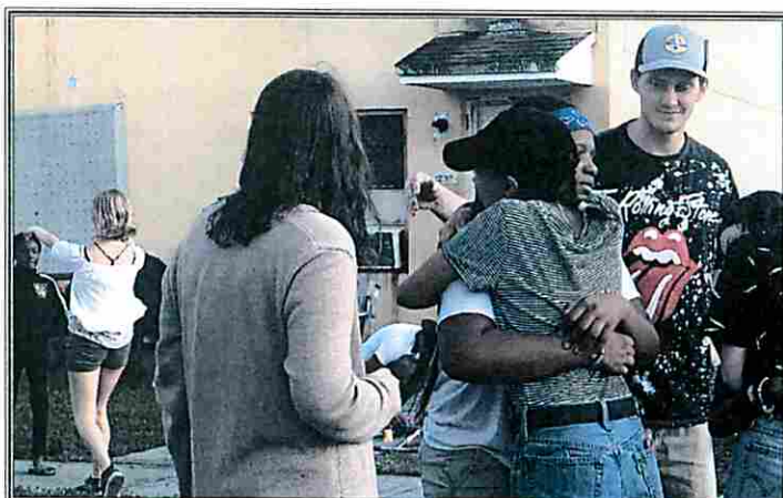
Here the kid's from the neighborhood are saying their goodbyes to the Liberty students. It is amazing how fast children can bond with high school and college students.