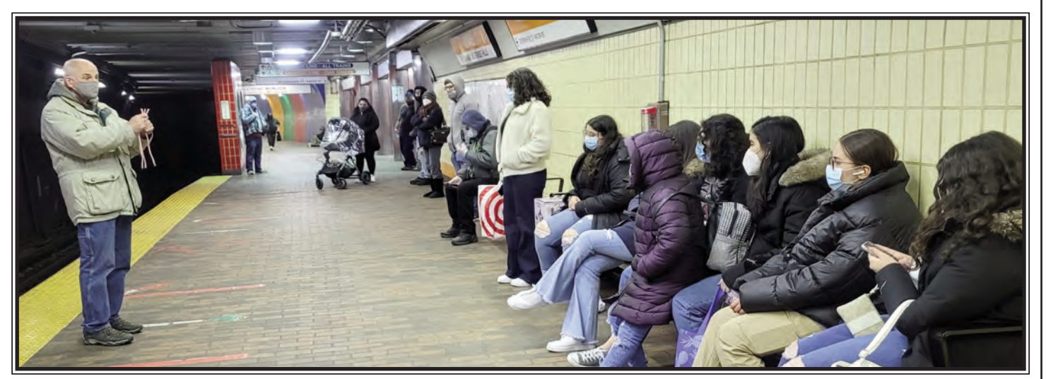
PEOPLE LISTENING TO THE PREACHING OF THE GOSPEL.