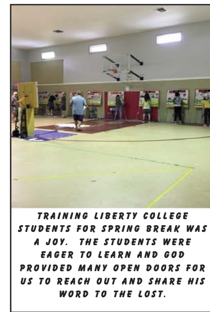
TRAINING LIBERTY COLLEGE STUDENTS FOR SPRING BREAK WAS A JOY. THE STUDENTS WERE EAGER TO LEARN AND GOD PROVIDED MANY OPEN DOORS FOR US TO REACH OUT AND SHARE HIS WORD TO THE LOST.