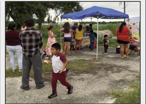
THE CHILDREN AND PARENTS REALLY APPRECIATE THE FOOD WE ARE ABLE TO BRING TO THEM.