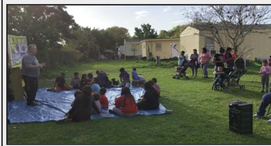
PLEASE CONTINUE TO PRAY FOR THESE CHILDREN AND THEIR PARENTS AT THE MIGRANT CAMPS.