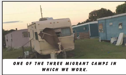
ONE OF THE THREE MIGRANT CAMPS IN WHICH WE WORK.