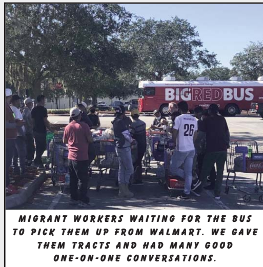
MIGRANT WORKERS WAITING FOR THE BUS TO PICK THEM UP FROM WALMART. WE GAVE THEM TRACTS AND HAD MANY GOOD ONE-ON-ONE CONVERSATIONS.