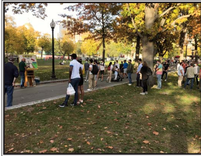
BOSTON COMMONS FOUR DAYS AFTER THE ELECTION.