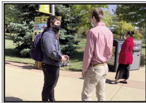
STUDENT FROM GOD'S BIBLE COLLEGE WITNESSING AT NORTHERN KENTUCKY UNIVERSITY.

AT NORTHEASTERN UNIVERSITY, THESE TWO STUDENTS WERE AGNOSTICS BUT ENDED UP ADMITTING THAT A GOD HAD TO EXIST. THEY WERE OPEN TO DISCUSS THE GOD OF THE BIBLE.