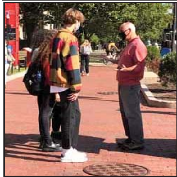
THREE STUDENTS FROM BOSTON U. HAD LITTLE KNOWLEDGE OF THE BIBLE BUT WERE VERY INTERESTED IN LEARNING THAT GOD'S LAW WAS LIKE A MIRROR REVEALING THE DIRT (SIN) THAT IS IN EVERYONE'S LIFE.