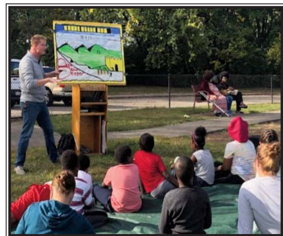
STUDENT FROM GOD'S BIBLE COLLEGE TEACHING CHILDREN IN THE OPEN AIR.