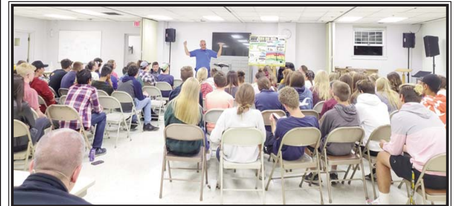
YOUTH GROUP MEETING WITH A LOCAL CHURCH IN MICHIGAN.