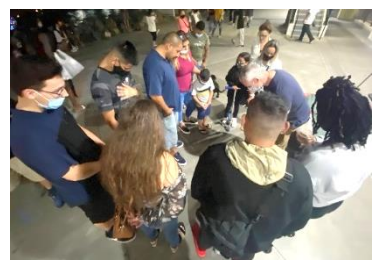
Me leading a group in prayer

An Incredible Night: Did you hear of the large prayer meeting that happened in Washington D.C. in late