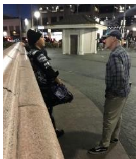
Another Huntington pier discussion

Knowing the Most High: At Huntington pier, I met a woman experienced with Alcoholics Anonymous (AA). She said her faith was her 'higher power'. I instructed her that the Bible enabled us to know the true God and that it directs us to grow from the basic topics of the Lord onto the deeper things ( milk to meat ).