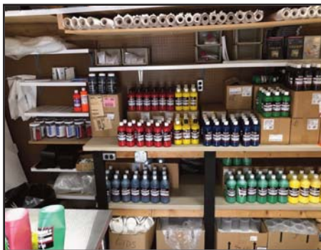
A partial view of our open-air supplies "warehouse" here in Nazareth!