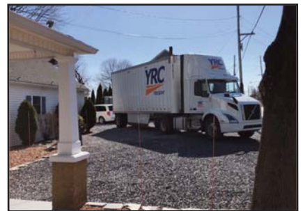
Open-air supplies arrive regularly, which enables us to ship to missionary workers in the USA and around the world.