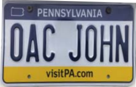
Travel to Baltimore coming soon!

Slowly, very slowly, our open-air ministry is able to go back out into the open air. You can read about this from the perspective of one of our OAC board members, Joe Toy, on side two.