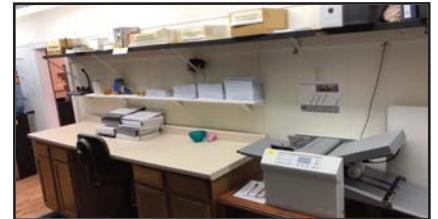
The hub of our printed communications preparation area!

Thank you, again, for praying and giving so we can continue on. We appreciate and need your help in this way.