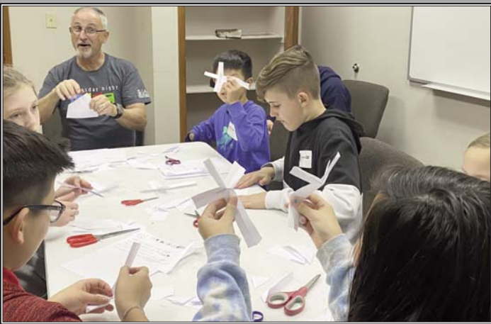
Hillcrest Baptist 5th & 6th graders learning how to share the Gospel with their friends through object lessons.