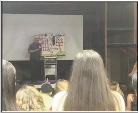
Speaking to a group of about 90 parents and kids for our home church's new semester kickoff for children.