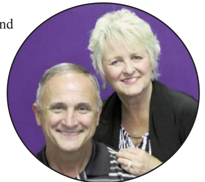
Serving Him Together,