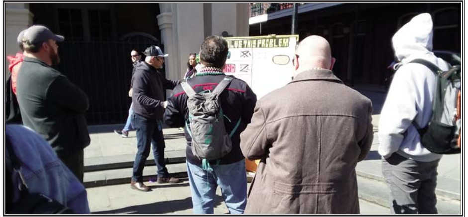
Me in the hat near the sketchboard preaching in Jackson Square at Mardi Gras.