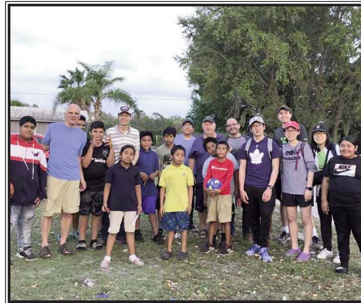
THE TORONTO TEAM WITH THE NEIGHBORHOOD KIDS ON THE LAST DAY. ONLY THE DOGS ARE MISSING. TWO DOGS SAT ON THE MAT ALL FIVE DAYS!