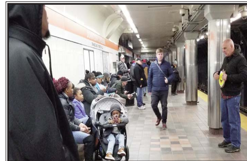
PREACHING IN THE SUBWAY USING EMOJIS.