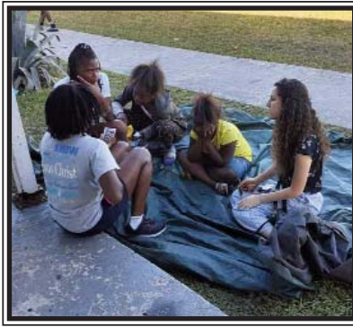
TWO LIBERTY STUDENTS WITNESSING TO TEENS AFTER A KIDS' PROGRAM. THIS IS THE TYPE OF COMMUNICATION THAT EXISTED ALL FIVE DAYS.