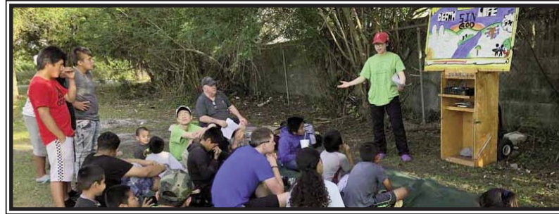
TEEN FROM PEOPLES CHRISTIAN ACADEMY OF TORONTO TEACHING A BIBLE LESSON AT A MIGRANT WORKERS TRAILER PARK IN RUSKIN, WHICH IS A SUBURB OF TAMPA.