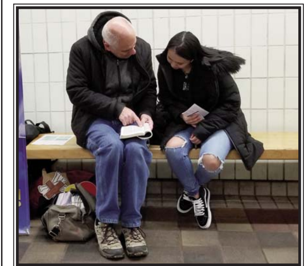
COUNSELING IN THE SUBWAY AFTER A MESSAGE.