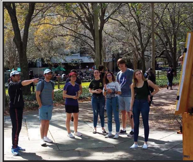
PEOPLES CHRISTIAN ACADEMY STUDENTS WITNESSING TO STUDENTS AT THE UNIVERSITY OF SOUTHERN FLORIDA. ONE STUDENT ASKED ME THIS ? "WHY DID JESUS ACCUSE GOD OF FORSAKING HIM?" THE COLLEGE CAMPUSES HAVE SOME GOOD SOIL IN WHICH TO SOW GOSPEL SEEDS.