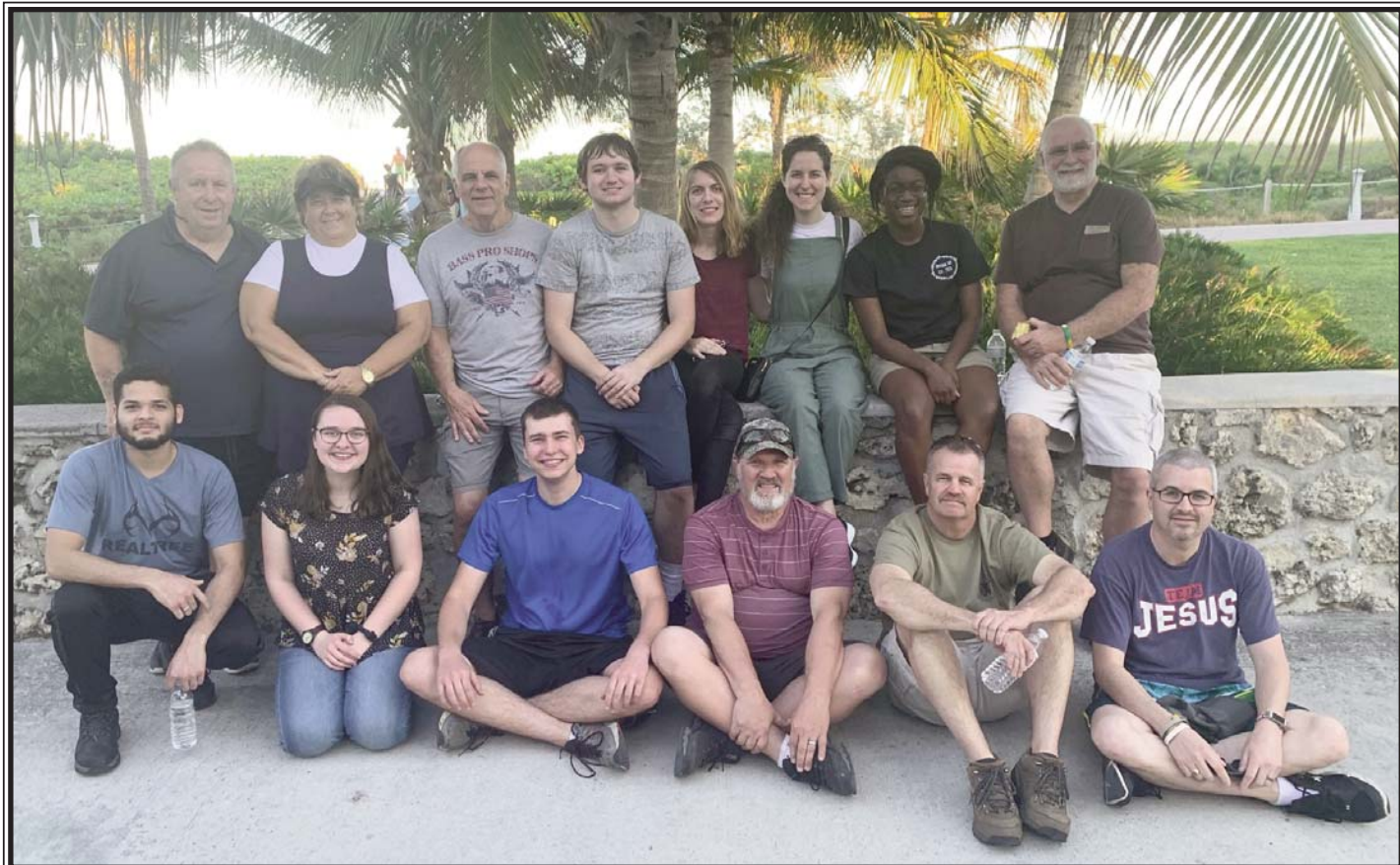
THE LIBERTY TEAM AND STAFF IN MIAMI. WE ARE THANKFUL THAT 90% OF OUR SCHEDULED MINISTRY WAS ABLE TO TAKE PLACE BEFORE THINGS WERE SHUT DOWN. THE TEAM MEMBERS HAD TO GO HOME A DAY EARLY BUT WERE ABLE TO MINISTER IN TWO NEIGHBORHOODS AS WELL AS AT LINCOLN MALL IN SOUTH BEACH.