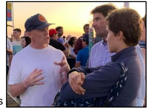
Conversing with French tourists