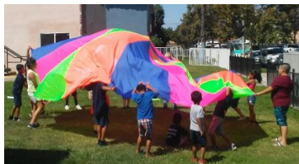
Enjoying the parachute game

Mouths of Babes: It's been great ministering in Santa Ana lately. I heard one boy singing a praise song outside of our worship time. On another afternoon, after the Gospel was clearly presented to them, they clapped their hands!