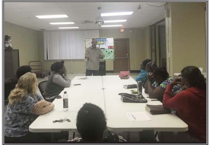
Here I am using the sketch-board at a Bible study in a public housing building in Dallas.