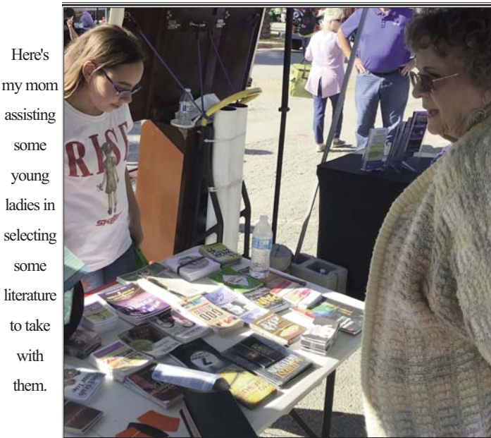
Here's my mom assisting some young ladies in selecting some literature to take with them.