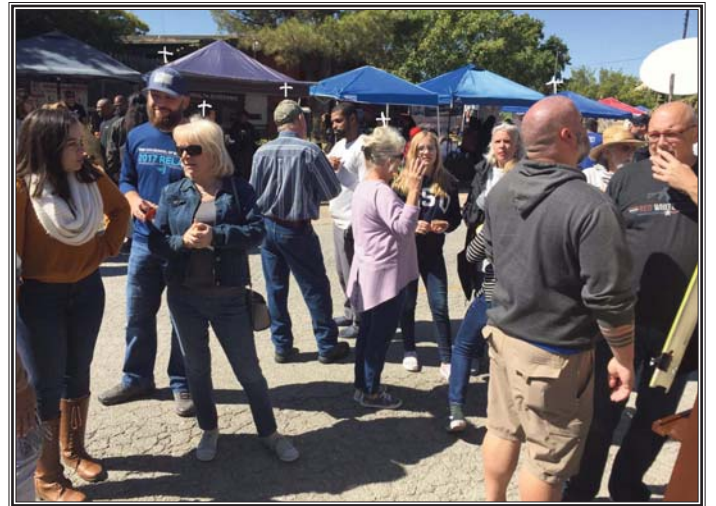
There are five evangelists in this picture from the Country Day On The Hill Festival. See if you can figure out which one's they are! We love it when the church gets outside the four walls to tell people about Jesus. Good things always happen!