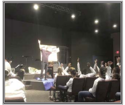
Here I am addressing the children at Hillcrest Baptist about planting the seeds of the Gospel with others that they come into contact with. Our children's director is very focused on getting even the 4-6th graders involved in evangelism and missions which is a great idea!