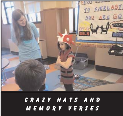
CRAZY HATS AND MEMORY VERSES

Before the mountains were brought forth, or ever thou hadst formed the earth and the world, even from everlasting to everlasting, Thou art God.