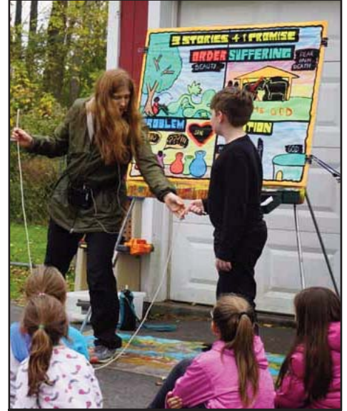
GOSPEL ILLUSION AT THE HARVEST PARTY