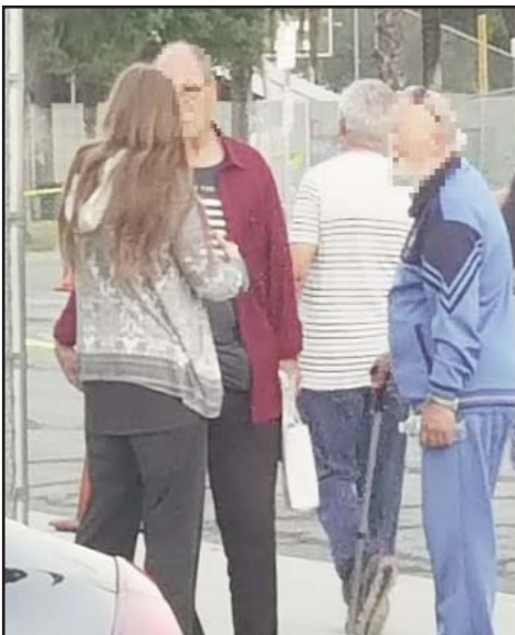
ARAB FESTIVAL OUTREACH IN ANAHEIM