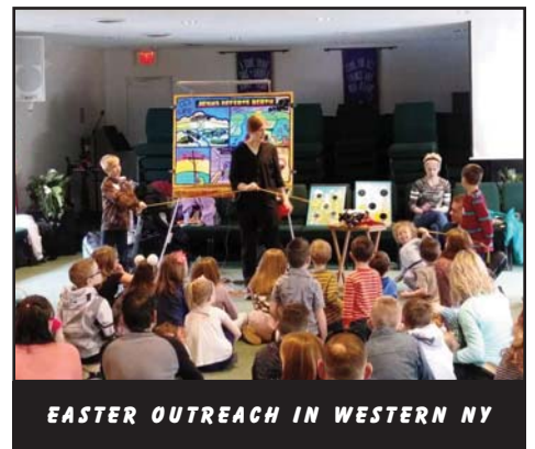
EASTER OUTREACH IN WESTERN NY