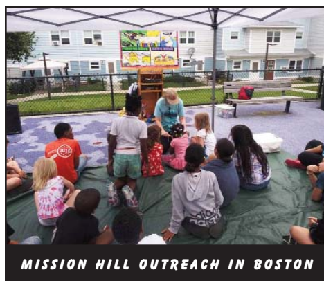
MISSION HILL OUTREACH IN BOSTON