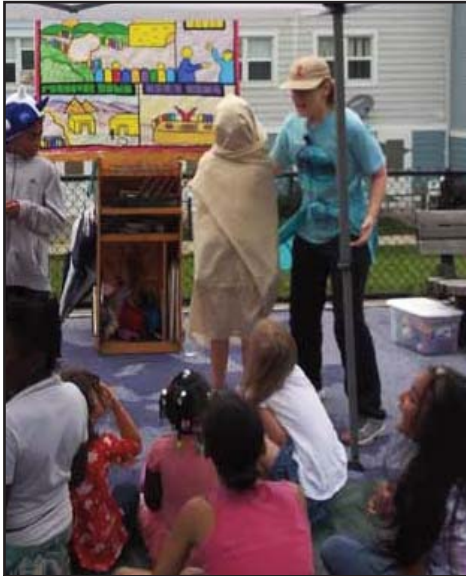
OUTREACH IN INNER-CITY BOSTON