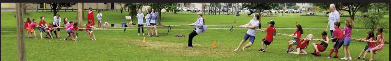
SOME SERIOUS TUG OF WAR!