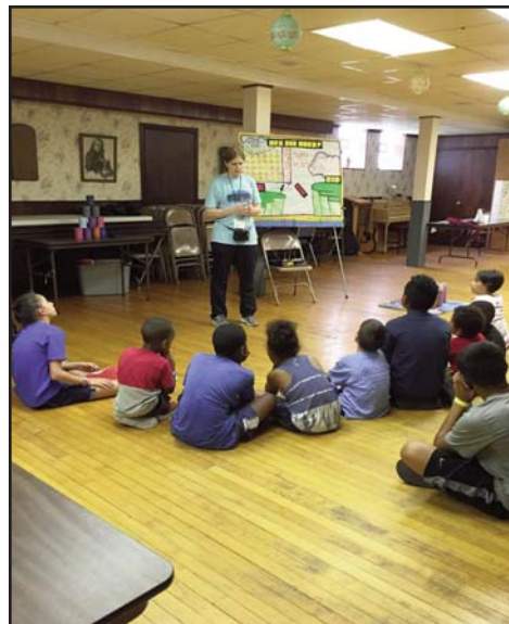
OUTREACH TO MUSLIM CHILDREN