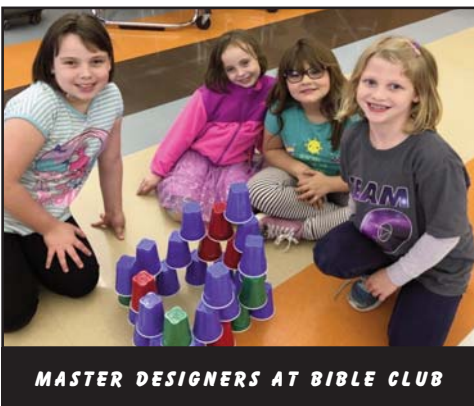
MASTER DESIGNERS AT BIBLE CLUB

...Lift up your eyes and look on the fields, for they are white already to harvest. John 4:35