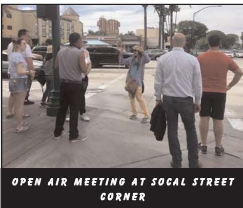
OPEN AIR MEETING AT SOCAL STREET CORNER