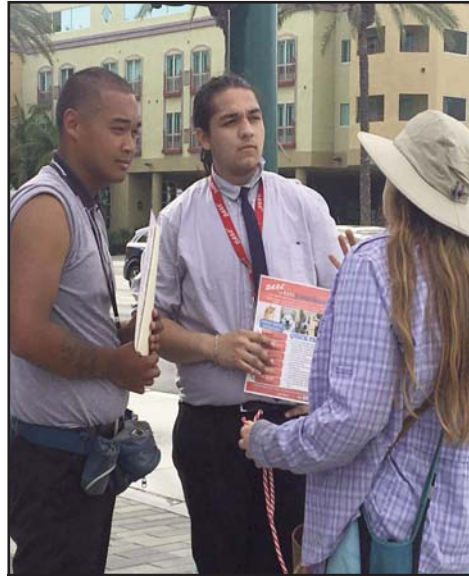
CALIFORNIA STREET MINISTRY