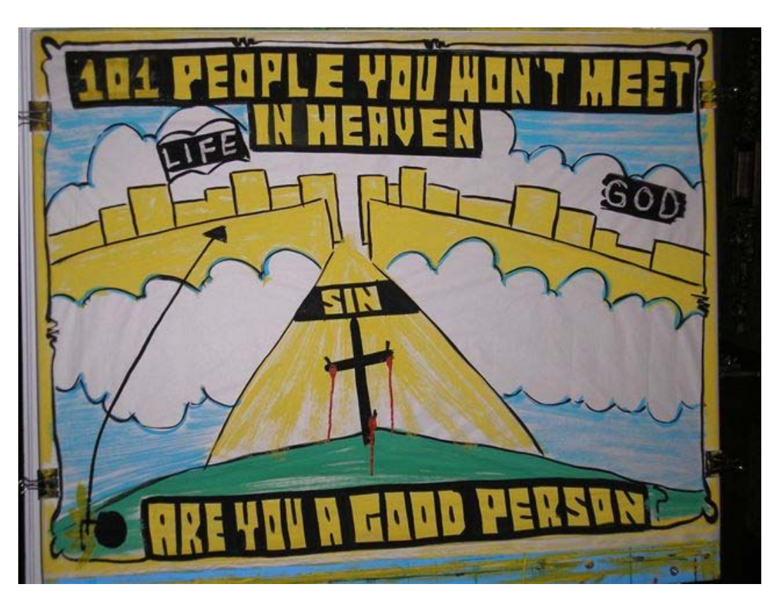
OAC * PO Box D * Nazareth * PA * 18064 www.oacusa.org