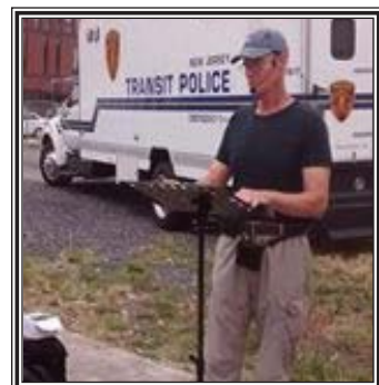
Preaching in Camden