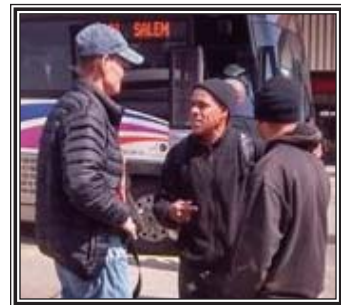
Counseling in Camden

Life is filled with problems. Addiction is one of the greatest all-consuming ones. People need the Lord Jesus! There is nothing He cannot do if we trust and obey Him.